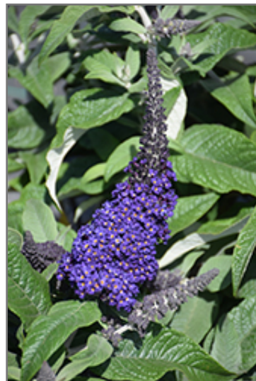
Pugster Blue Butterfly Bush flowers

Pugster Blue Butterfly Bush is recommended for the following landscape applications;