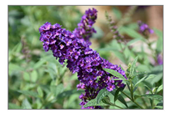
Miss Violet Butterfly Bush flowers

Miss Violet Butterfly Bush is a multi-stemmed deciduous shrub with a more or less rounded form. Its average texture blends into the landscape, but can be balanced by one or two finer or coarser trees or shrubs for an effective composition.