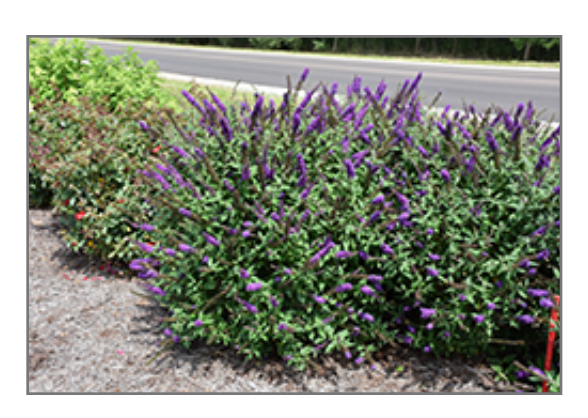
Miss Violet Butterfly Bush in bloom

This is a relatively low maintenance shrub, and is best pruned in late winter once the threat of extreme cold has passed. It is a good choice for attracting bees, butterflies and hummingbirds to your yard, but is not particularly attractive to deer who tend to leave it alone in favor of tastier treats. It has no significant negative characteristics.