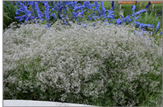
Common Baby's Breath in bloom

Common Baby's Breath is recommended for the following landscape applications;