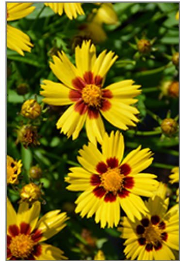
Sunkiss Tickseed flowers