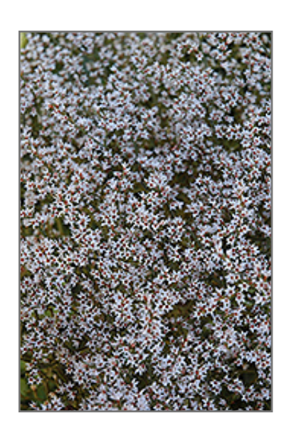
German Statice flowers

German Statice will grow to be about 12 inches tall at maturity, with a spread of 12 inches. Its foliage tends to remain dense right to the ground, not requiring facer plants in front. It grows at a medium rate, and under ideal conditions can be expected to live for approximately 10 years. As an herbaceous perennial, this plant will usually die back to the crown each winter, and will regrow from the base each spring. Be careful not to disturb the crown in late winter when it may not be readily seen!