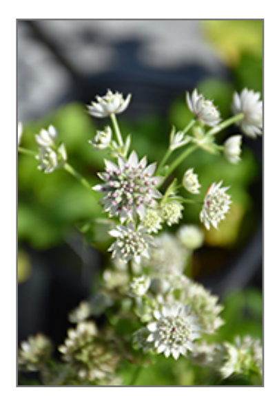
Star Of Billion Masterwort flowers

Starry white pincushion flowers on rising stems; great on streambanks or in a moist border, doesn't like to dry out; cut back after flowering for a second flush