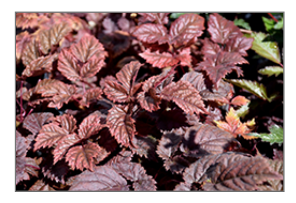
Chocolate Shogun Astilbe foliage