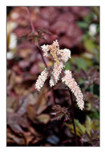
Chocolate Shogun Astilbe flowers

This is a relatively low maintenance plant, and is best cleaned up in early spring before it resumes active growth for the season. It is a good choice for attracting butterflies to your yard, but is not particularly attractive to deer who tend to leave it alone in favor of tastier treats. It has no significant negative characteristics.