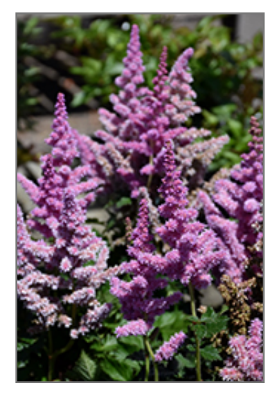
Little Vision In Purple Chinese Astilbe flowers

This dwarf variety produces showy dark plumes with a purplish cast, rising above deep green leaves; dense, upright form; perfect in a shady spot with dappled light; prefers moisture so water regularly for abundant flowers and nice foliage