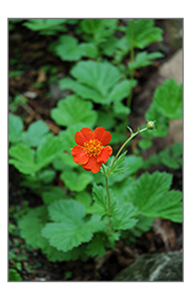
Werner Arends Avens flowers

A compact selection that features low growing mounds of lush green foliage and tall stems of rich orange semi-double flowers; low maintenance variety, perfect for borders, butterfly gardens and containers; good cut flower