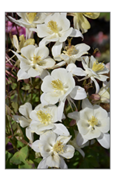
Origami White Columbine flowers

Dainty, nodding, bell-shaped white flowers on a compact, many-branched plant; makes a welcome addition to shade and woodland gardens