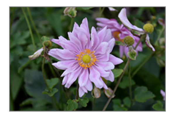
Alice Anemone flowers