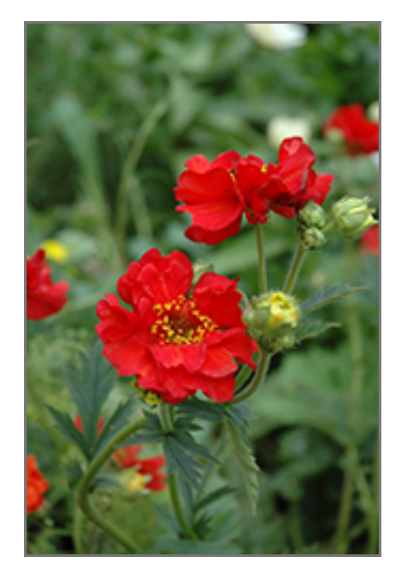
Mrs. Bradshaw Avens flowers

Mrs. Bradshaw Avens is an herbaceous perennial with tall flower stalks held atop a low mound of foliage. Its relatively fine texture sets it apart from other garden plants with less refined foliage.