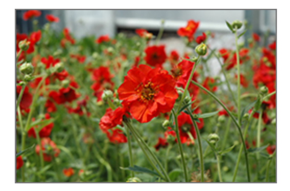
Mrs. Bradshaw Avens in bloom

This is a relatively low maintenance plant, and should be cut back in late fall in preparation for winter. It is a good choice for attracting butterflies to your yard, but is not particularly attractive to deer who tend to leave it alone in favor of tastier treats. It has no significant negative characteristics.