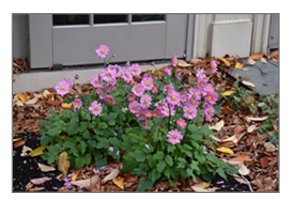
Pamina Anemone in bloom

This is a relatively low maintenance plant, and is best cleaned up in early spring before it resumes active growth for the season. Deer don't particularly care for this plant and will usually leave it alone in favor of tastier treats. It has no significant negative characteristics.