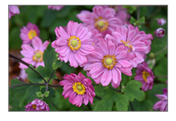
Pamina Anemone flowers

Pamina Anemone is a dense herbaceous perennial with an upright spreading habit of growth. Its relatively fine texture sets it apart from other garden plants with less refined foliage.