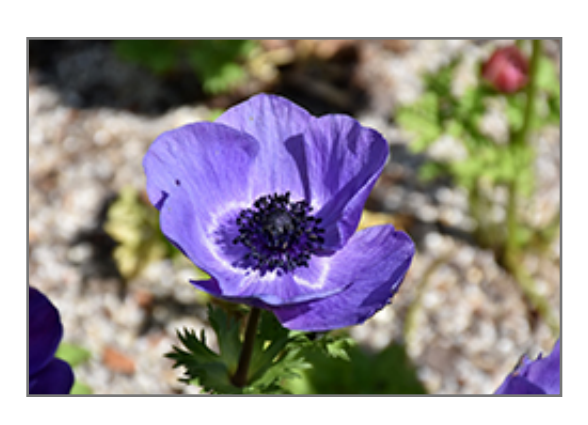
Windflower flowers

This variety forms a dense clump of ferny foliage in spring, then produces stunning poppy-like flowers, in a variety of colors, on tall stems that sway in the breeze; very pretty when massed in the garden or along borders