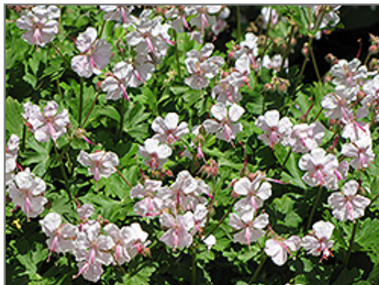
Biokovo Cranesbill in bloom