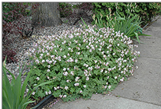
Biokovo Cranesbill in bloom