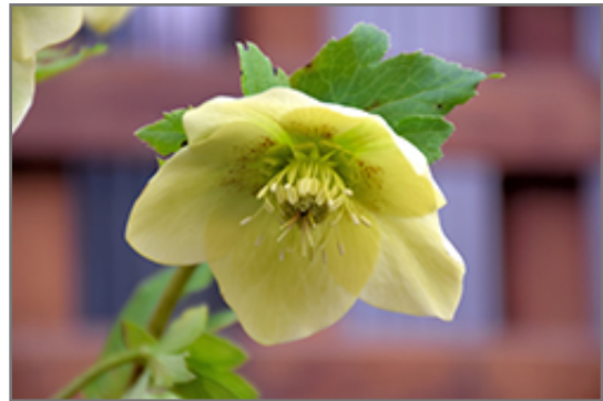
Yellow Jubilee Hellebore flowers