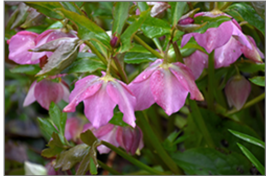
Red Selection Hellebore flowers

Other Names: Red Hybrid Hellebore, Lenten Rose, Winter Rose