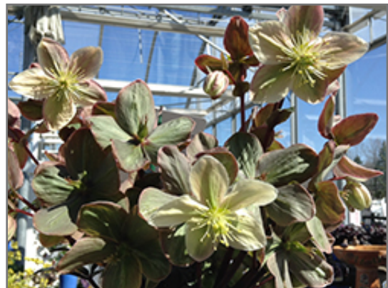
Winter Sunshine Hellebore flowers