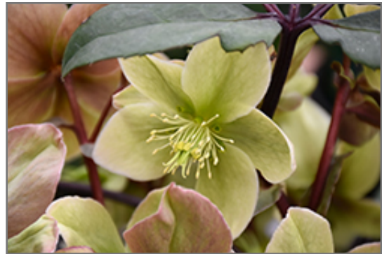
Winter Sunshine Hellebore flowers

Winter Sunshine Hellebore is recommended for the following landscape applications;