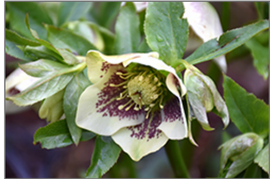
Winter Jewels Painted Hellebore flowers

Winter Jewels Painted Hellebore is recommended for the following landscape applications;