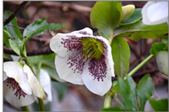
White Lady Spotted Hellebore flowers