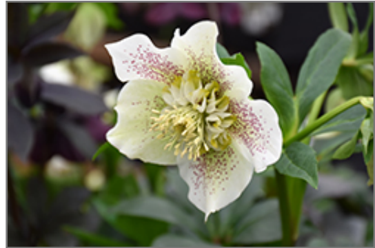
Tutu Hellebore flowers