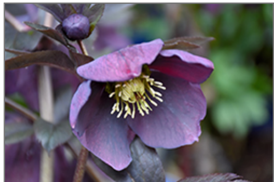
Spring Sunset Hellebore flowers