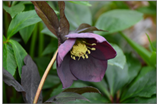
Spring Sunset Hellebore flowers

Spring Sunset Hellebore is recommended for the following landscape applications;