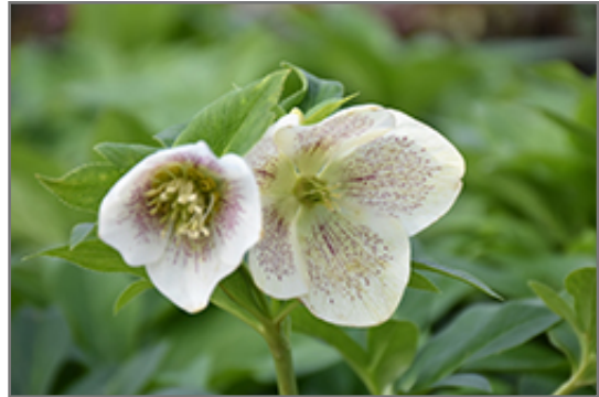
Spring Promise Conny Hellebore flowers