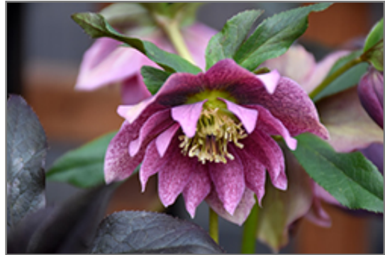
Spring Princess Hellebore flowers

Spring Princess Hellebore is recommended for the following landscape applications;