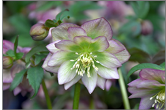
Spring Diamond Hellebore flowers

Spring Diamond Hellebore is recommended for the following landscape applications;