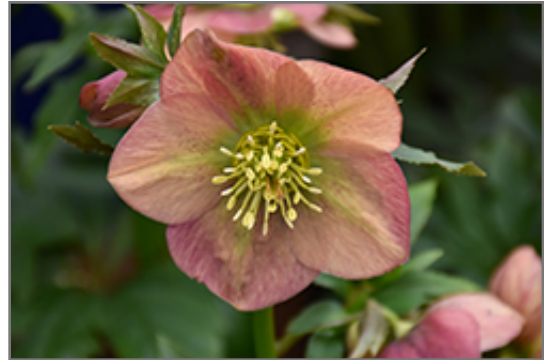
Spring Darling Hellebore flowers

Spring Darling Hellebore is recommended for the following landscape applications;