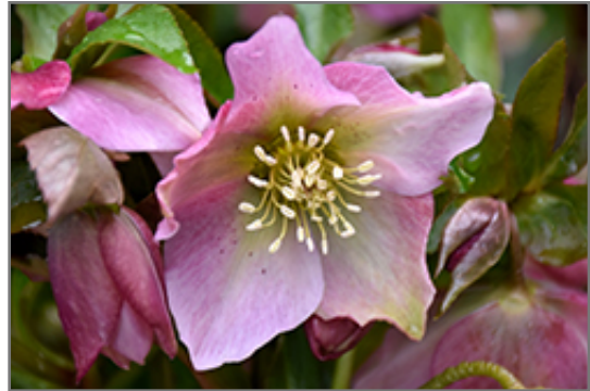
Spring Charm Hellebore flowers