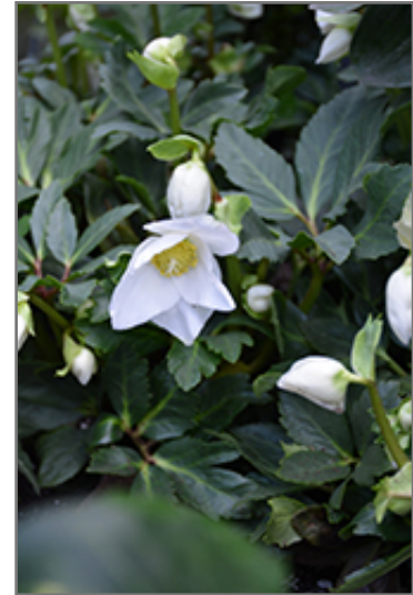
Snow White Hellebore flowers