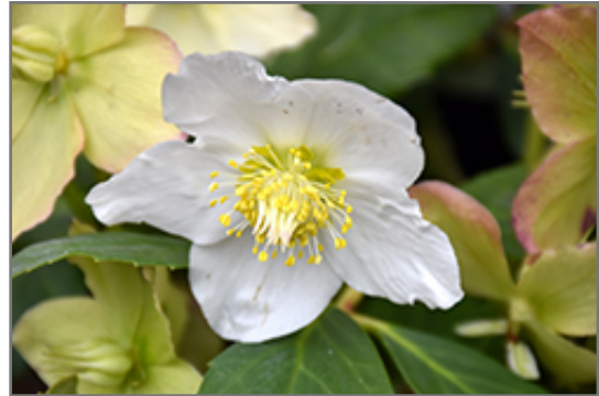
Gold Collection Snow Frills Hellebore flowers