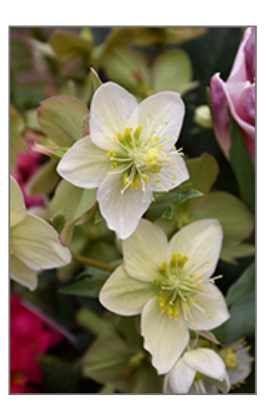
Gold Collection Shooting Star Hellebore flowers

Large, outfacing buttercup-type blooms are creamy white with a green tinge, maturing to pink; one of the first flowers to come up in cool weather and what a beautiful harbinger they are; great in woodland gardens and on shaded slopes