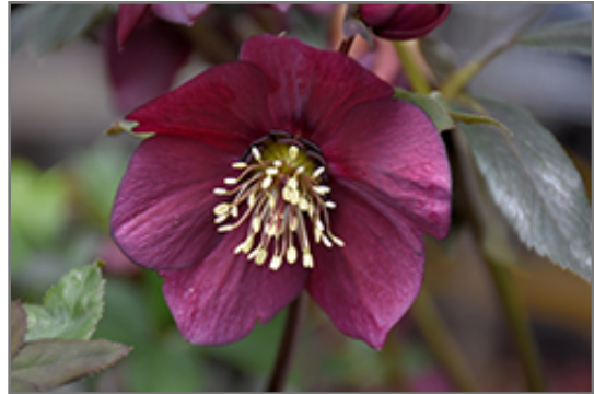
Winter Jewels Ruby Wine Hellebore flowers

Winter Jewels Ruby Wine Hellebore is recommended for the following landscape applications;