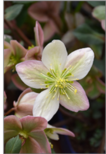
Pirouette Hellebore flowers

Pink buds, rising above the leaves, that open to white flowers with a pink blush, maturing to a deeper pink; deep blue-green foliage with lighter green veins; one of the first flowers to come up in cool weather, a true indicator of spring