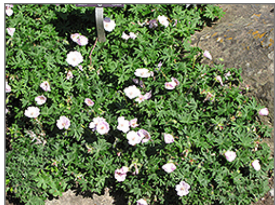
Striated Cranesbill in bloom