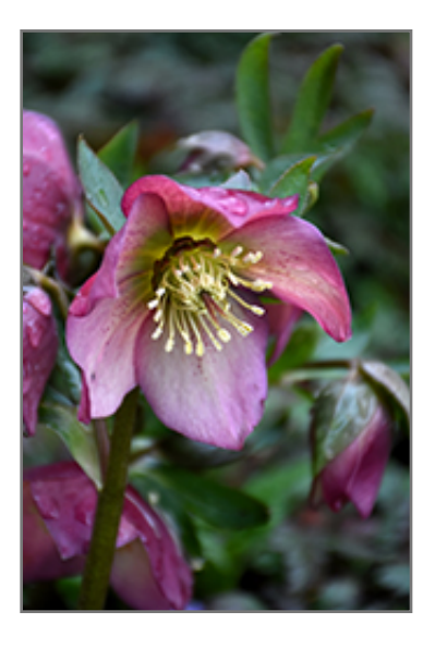
Honeymoon Paris In Pink Hellebore flowers

This is a relatively low maintenance plant, and should be cut back in late fall in preparation for winter. Deer don't particularly care for this plant and will usually leave it alone in favor of tastier treats. It has no significant negative characteristics.