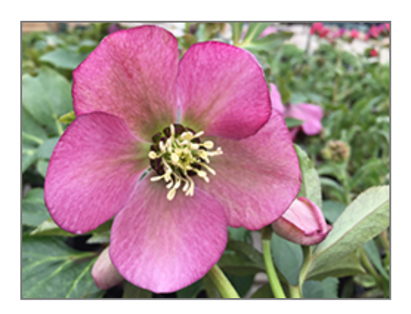
Honeymoon Paris In Pink Hellebore flowers