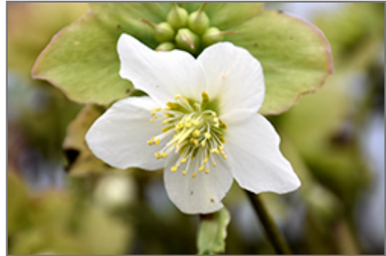
Josef Lemper Hellebore flowers

Josef Lemper Hellebore is recommended for the following landscape applications;