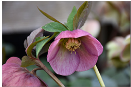
Mardi Gras Pink Hellebore flowers