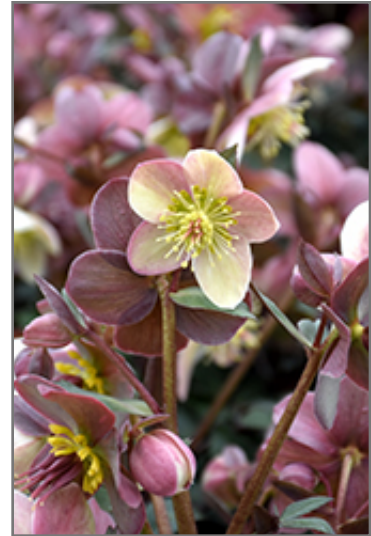
Love Bug Hellebore flowers