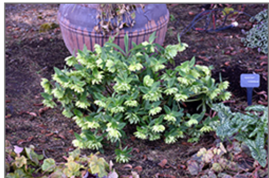
Winter Jewels Jade Tiger Hellebore in bloom