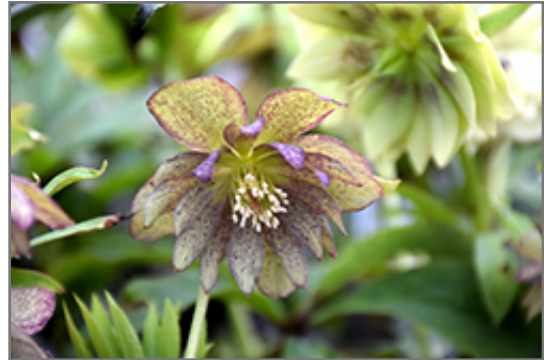
Winter Jewels Jade Tiger Hellebore flowers

Winter Jewels Jade Tiger Hellebore is recommended for the following landscape applications;