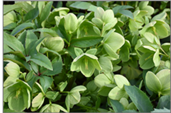
Ice Breaker Max Hellebore flowers

Ice Breaker Max Hellebore is recommended for the following landscape applications;