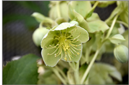
Green Corsican Hellebore flowers

Green Corsican Hellebore is recommended for the following landscape applications;