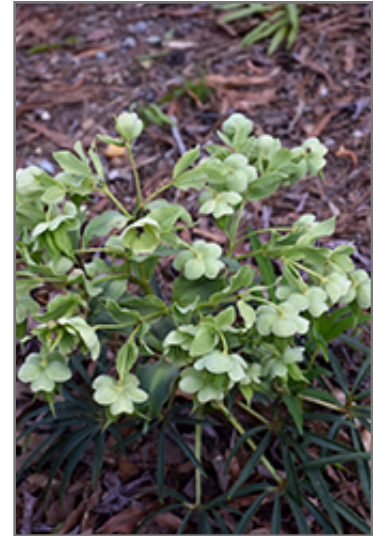
Picadilly Strain Hellebore flowers

Buttercup-type dangling clusters of flowers are small and chartreuse colored, emerge in late winter and spring, one of the first flowers to come up in cool weather and a harbinger of spring; attractive, narrow metallic blue-green leaves have a fetid odor