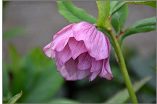
Double Purple Mystique Hellebore flowers

Double Purple Mystique Hellebore is recommended for the following landscape applications;