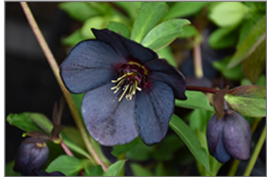
Winter Jewels Black Diamond Hellebore flowers

Winter Jewels Black Diamond Hellebore is recommended for the following landscape applications;