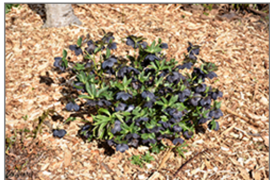
Winter Jewels Black Diamond Hellebore in bloom