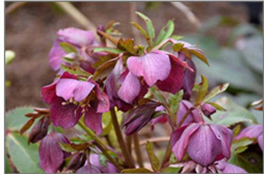
Purple Hellebore flowers