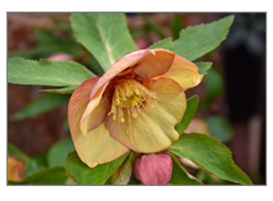
Winter Jewels Apricot Blush Hellebore flowers

This attractive variety produces bushy mounds of thick evergreen leaves; flower stalks, held above the foliage bear showy, cup shaped, peachy-apricot blooms with dark rose speckling, veining or picotee; a great selection for shade gardens