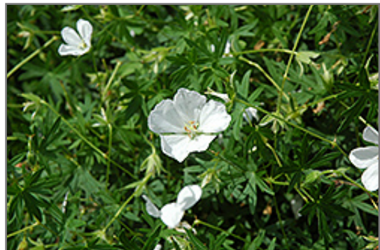
White Cranesbill flowers