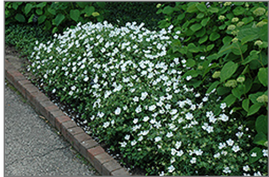
White Cranesbill in bloom

White Cranesbill is recommended for the following landscape applications;