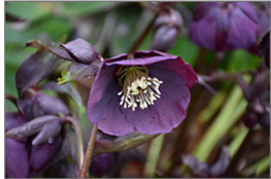
Winter Jewels Amethyst Glow Hellebore flowers