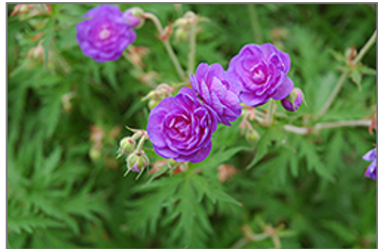
Double Cranesbill flowers

Beautiful double flowers in shades of rose and purples are featured on mounds of deep green foliage; fast and vigorous growth, excellent for border, bed and container planting; low maintenance-remove spent flowers to encourage more blooms