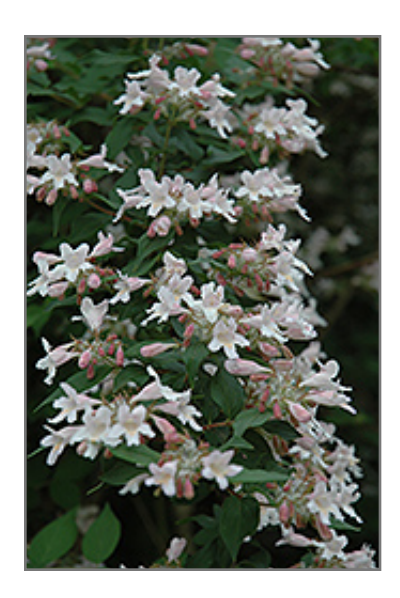
Beautybush flowers