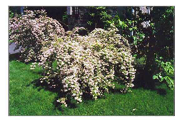
Beautybush in bloom