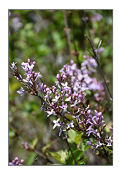
Purple Haze Persian Lilac flowers